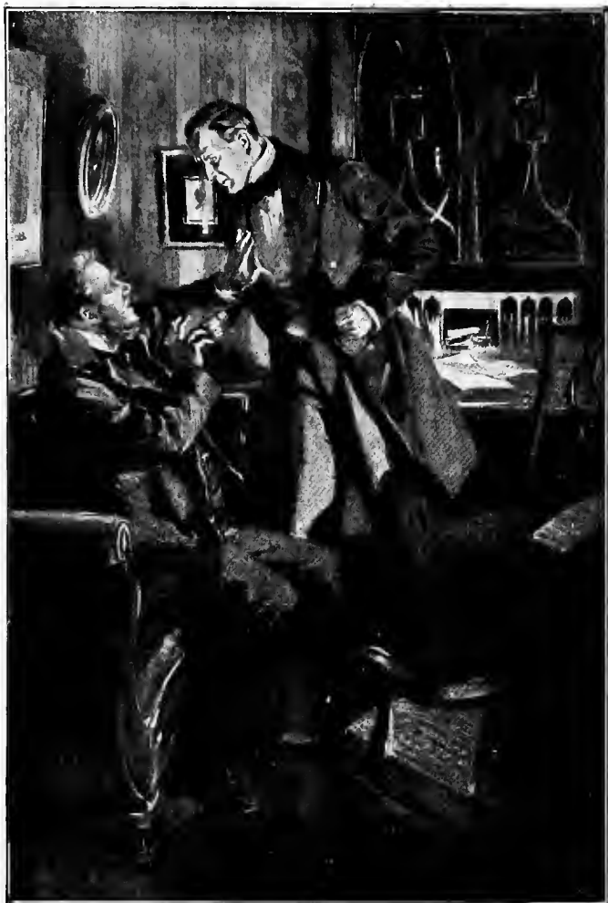
The doctor stood over the captain with eyes blazing and fists tightly clenched.